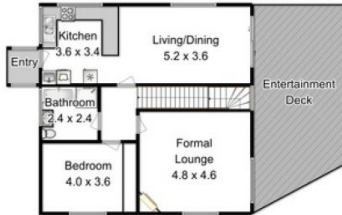
Approx. First Floor Area: 89 Sqm